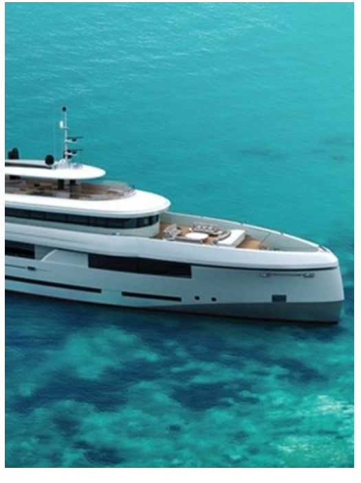
Base Creative helped Kingship to refine its brand identity and to project the exceptional quality which has earned it the title of "Best Asian Motor Yacht Builder" across all touchpoints – including identity, print ads, brochure, and website.